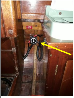
H-class - forward of the wash basin in the forward cabin

The battery isolator switch should only be used if an emergency requires all power to be turned off or if the engine is not being used for a prolonged period. It is mounted in the forward cabin of 2- and 3-berth boats and in the companion way of 4-berth boats -